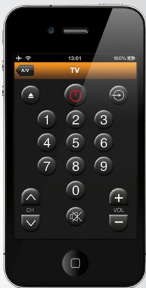
TV widget First page