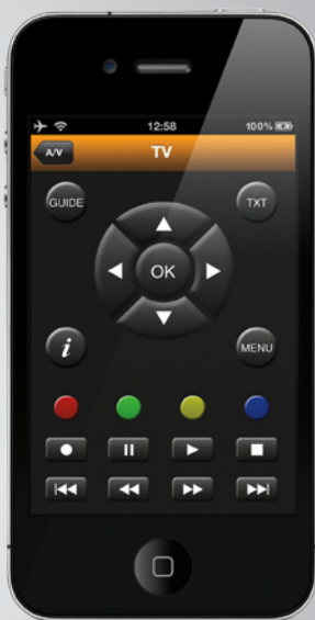
TV widget second page