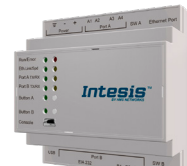
INKNXHISXXXO000 VRF Systems 16/64 Indoor Units