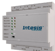
INMBSHISXXXO000 VRF Systems 16/64 Indoor Units