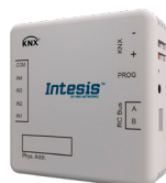
INKNXHIS001R000 VRF Systems 1 I.U. with Binary Inputs