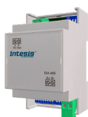
INMBSHIS001R000 VRF Systems 1 Indoor Unit