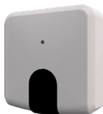
INKNXUNIO01I000 Universal Infrared AC 1 I.U. with Binary Inputs