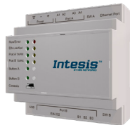
INBACHISXXXO000 VRF Systems 16/64 Indoor Units