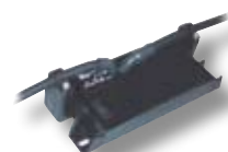
Lighting receiver module