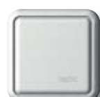
Indoor RTS lighting