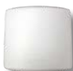
Outdoor RTS lighting