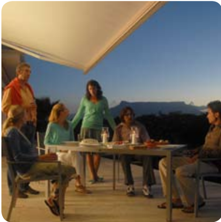
AN EXTRA ROOM ALL YEAR ROUND

What's more, thanks to Somfy's RTS technology and a new range of compatible automatic systems you can upgrade when you want, according to your needs.