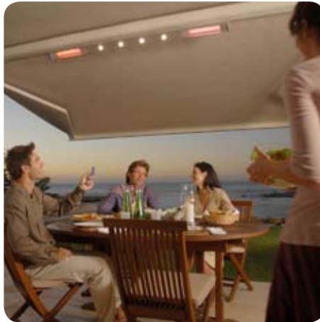
OUT ON THE TERRACE, WHATEVER THE SEASON, WITH SOMFY